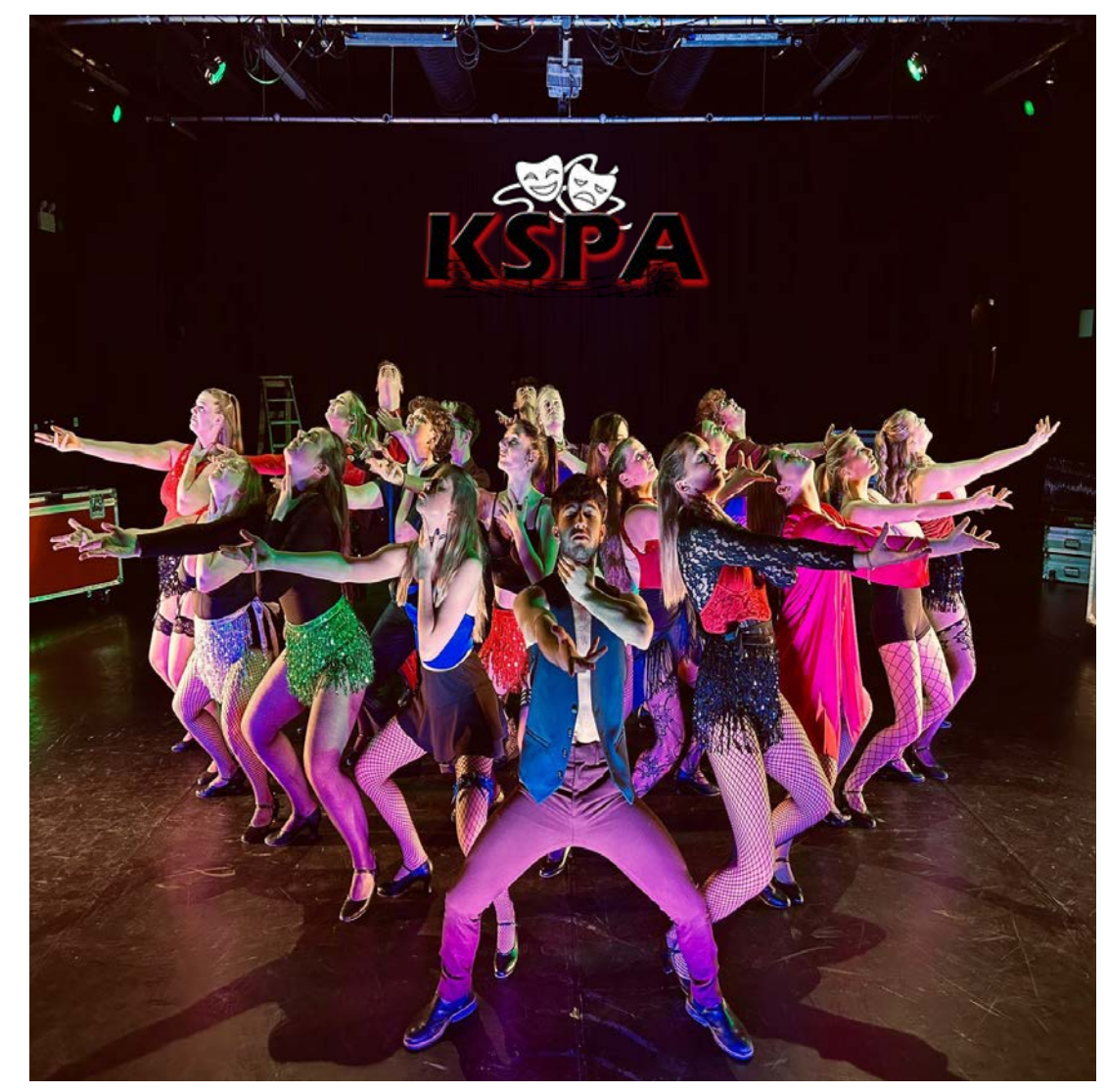
The Canterbury Institute for The Performing Arts

Many students have gone on to appear on stage, in film and on TV. Others have gone on to top class universities, for example; Royal Academy for Dramatic Arts (RADA), Italia Conti, Emil Dale, Performers College, Bird College and Urdang.