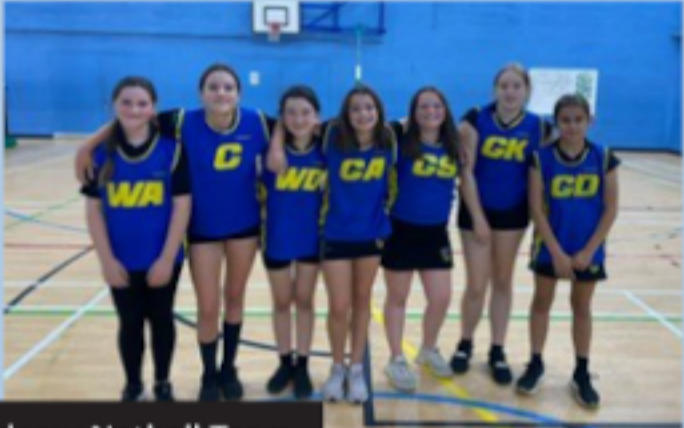
Academy Netball Team