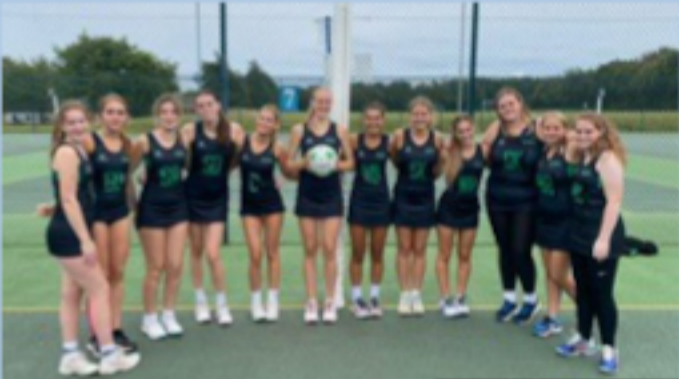
Sixth Form Netball Team