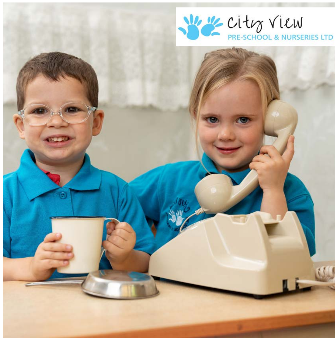
City View Pre-School and Nurseries

Why not come and see for yourself? We would be delighted to show you around. We are confident that you will enjoy our high standard of provision, which meets the distinct needs of our children and their families.